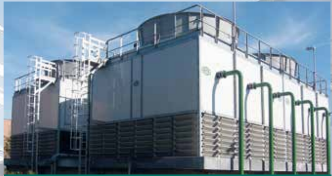
Plant after the replacement with MITA modules