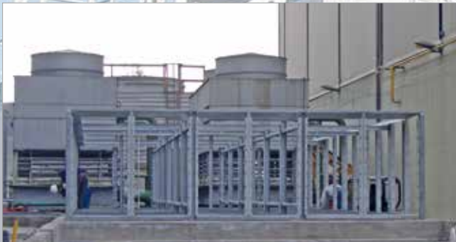
Plant before the replacement with a MITA solution