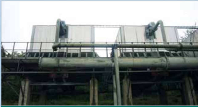
Plant before the replacement with a MITA solution