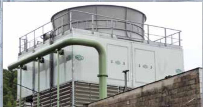
Plant after the replacement with MITA modules