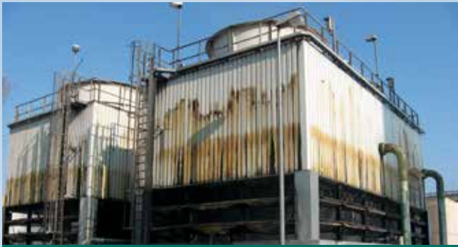
Plant before the replacement with a MITA solution