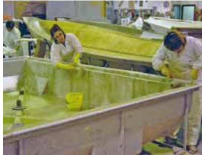
FRP (non-corroding material) manufacture process