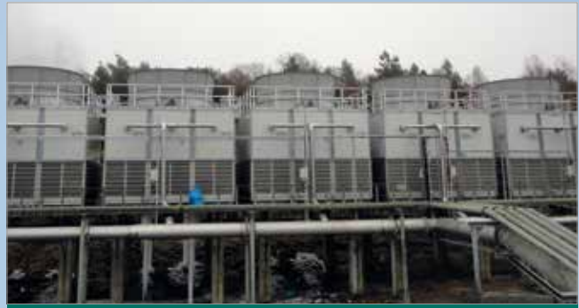
Plant after the replacement with MITA modules