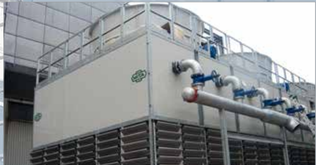
Plant after the replacement with MITA modules