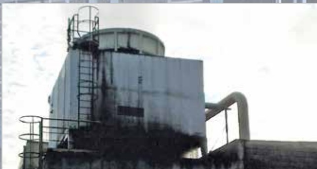
Plant before the replacement with a MITA solution